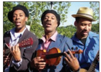
The Carpetbag Theatre